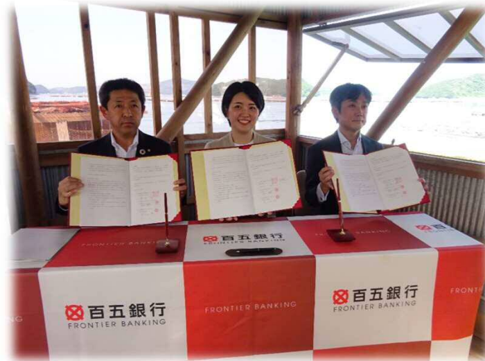
The three companies sign an agreement at an offshore oyster shack (Toba City)