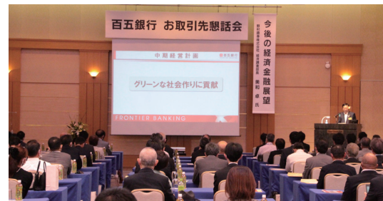
Business partner gathering