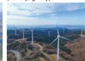
Aoyama Kogen (highlands) (Tsu-city, Iga-city)