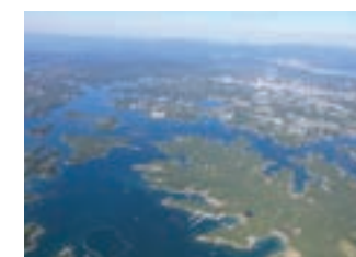
Ria coastline (Shima-city)