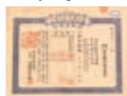
Share certificate of The Hyakugo Bank, Ltd. at the time of its establishment

Restructured as an ordinary bank and name changed to The Hyakugo Bank, Ltd.