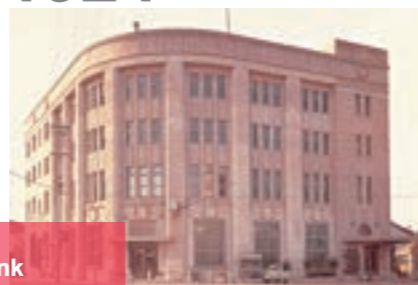
Photo: The Head Office in 1924