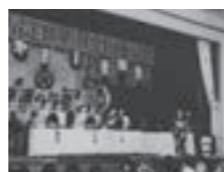
Lottery for the Fukuju Term Deposit

Started soliciting for the Fukuju Term Deposit as part of the Hyakugo Bank Deposit Reinforcement Campaign, aiming to use the funds for reconstruction, and reached ¥10 billion in 1952.