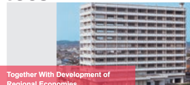
Photo: The Head Office in 1968

Together With Development of Regional Economies —Striving To Be the Bank With the Most Advanced Customer Service in Japan—