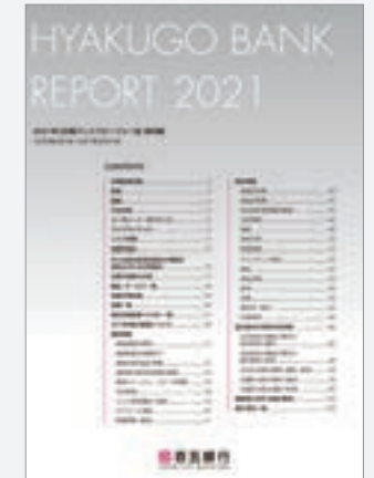
Data Edition (Issued in January and July)