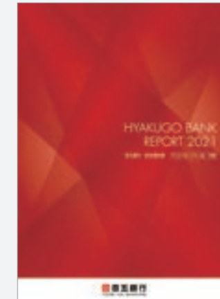
Integrated Report (Issued in July)

In addition, the disclosure book (data edition) based on Article 21 of the Banking Act is published in July and January every year. Please see the Bank's website.