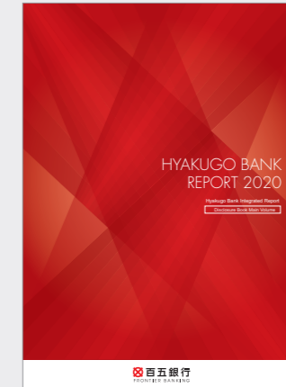
Integrated Report (Issued in July)

In addition, the disclosure book (data edition) based on Article 21 of the Banking Act is published in July and January every year. Please see the Bank's website.