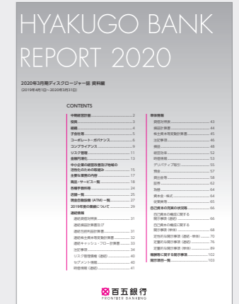
Data Edition (Issued in January and July)